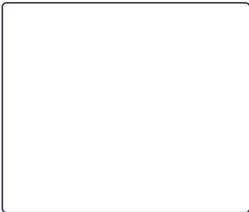
Example Site Plan

Please add a drawing of your property and include where the meter / service pipe termination is located, or any other information which you feel would be useful to help us process your application. Alternatively, you can provide a site plan with your application.