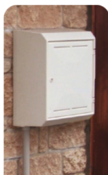
Surface mounted meter box