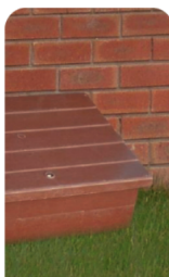
Semi-concealed meter box

Northern Gas Networks will supply surface mounted or semi concealed meter boxes. Should you require a built in box, you or your builder will need to supply this and build it into your wall. Northern Gas Networks do not fit gas meters - you will need to contact your preferred gas supplier and arrange for them to fit a meter to your new gas supply.