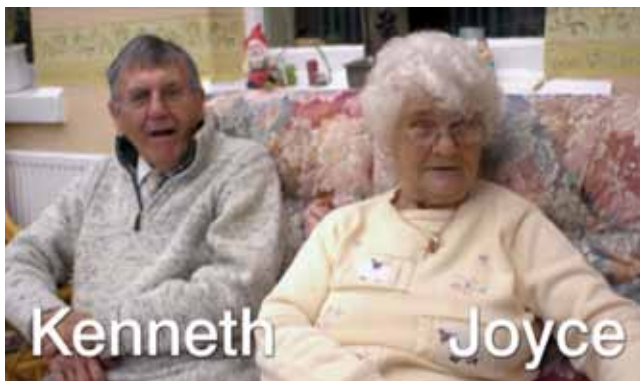
Film still from the initial campaign research.

Risk of a CO fatality among over 70s is five times that of other age groups.*