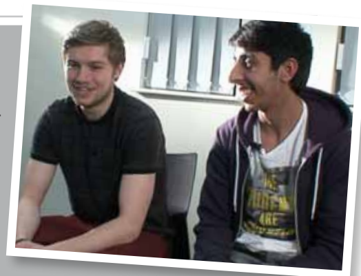
Film still from campaign R&D.

iCop is designed to empower young people to protect themselves against CO; it focuses on the symptoms of CO and clearly defines the actions they need to take to avoid being a victim. The campaign is measurable and designed to show engagement through a change in behaviour.